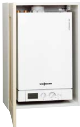
Compact dimensions – suitable for standard kitchen wall units