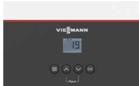
LCD screen with white backlight and 4 buttons

The heating water and DHW temperatures can be set quickly with the user friendly push-buttons. Operating states and temperatures are shown on the digital display screen.