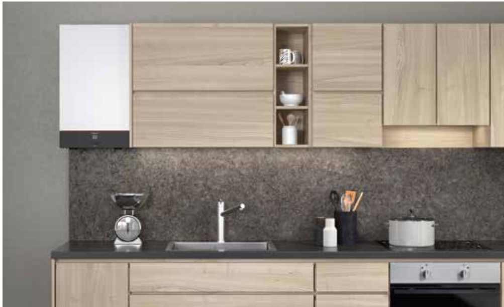
Vitodens 025-W featuring an attractive design in Vitopearlwhite

Compact and efficient wall mounted gas condensing boilers with a very attractive price/performance ratio