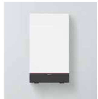
Vitodens 025-W (type BPKB)