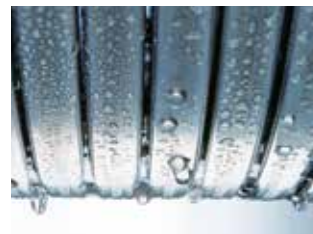
Inox-Radial heat exchanger

Stainless steel makes all the difference. The corrosion-resistant, stainless steel Inox-Radial heat exchanger plays a crucial role within the Vitodens 025-W. It efficiently converts the input energy into heat. In addition, the particularly durable, high grade stainless steel ensures reliability.