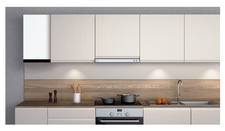
Vitodens 100-W Heat only with attractive design in the colour Vitopearl white

An open vent, wall mounted gas fired condensing boiler compact enough to fit in a standard kitchen cupboard.