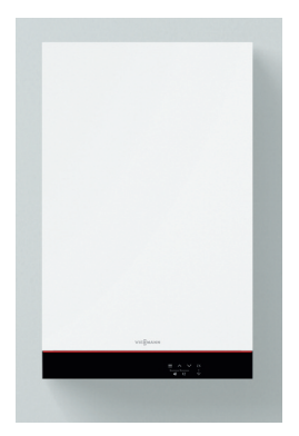
Vitodens 100-W heat only (Type B1GA)