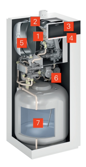
Vitodens 222-F with DHW storage (type B2TE)