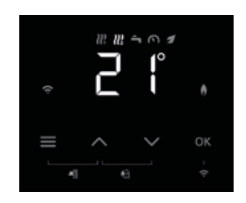
LCD touchscreen display