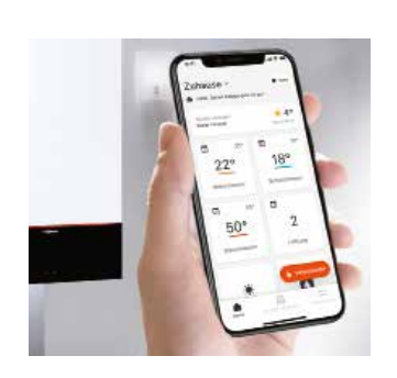
Use the ViCare app to conveniently operate the heating system and save energy – at any time, from anywhere.

Additionally, connecting a ViCare Thermostat to the boiler using its WiFi interface means that not only can even more comfort and efficiency be enjoyed, but importantly no third party controls are required and everything is contained in a single Viessmann ecosystem.