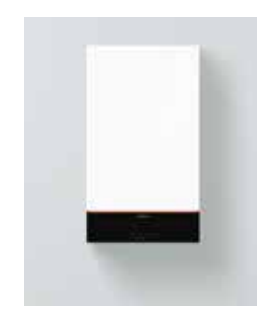
Vitodens 100-W (B1HF and B1KF)