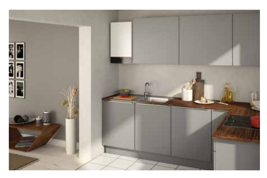
Vitodens 100-W with attractive design in Vitopearlywhite finish

Compact and efficient wall-mounted gas condensing boilers, economical to run and exceptional value.