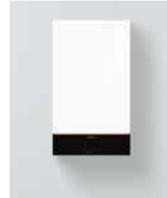
Vitodens 100-W (B1HF and B1KF)

Viessmann UK Hortonwood 30 Telford TF1 7YP www.viessmann.co.uk