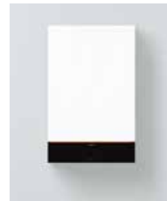
Vitodens 111-W (B1LF)