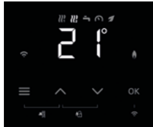
LCD touchscreen display