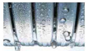
Inox-Radial heat exchanger

on stainless steel heat exchangers for gas condensing boilers up to 150 kW