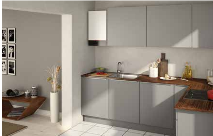
Vitodens 100-W with attractive design in Vitopearlwhite finish

Compact and efficient wall-mounted gas condensing boilers, economical to run and exceptional value.