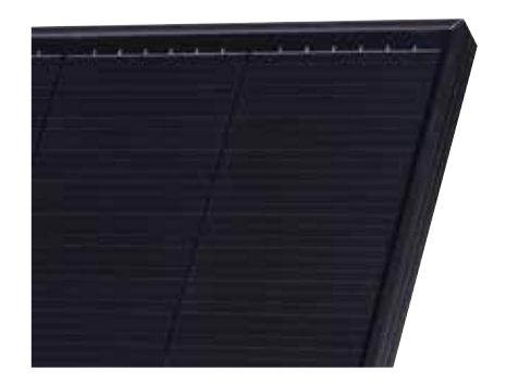
Vitovolt 300 in Detail